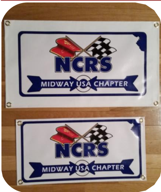
Examples of Smaller Banners

All Proceeds go to Benefit The American Cancer Society