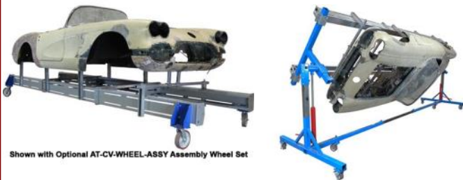
Shown with Optional AT-CV-WHEEL-ASSY Assembly Wheel Set

Auto Twirler Corvette Rotisserie and Body Cart Includes the optional short center sections and wheels. Rotisserie is red and body cart is black. Both are powder coated. $3000.00 firm. Pick up in Wichita, KS. Dallas Keller (316-200-4125)